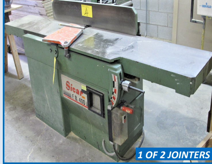
SICAR F.B. 400 JOINTER