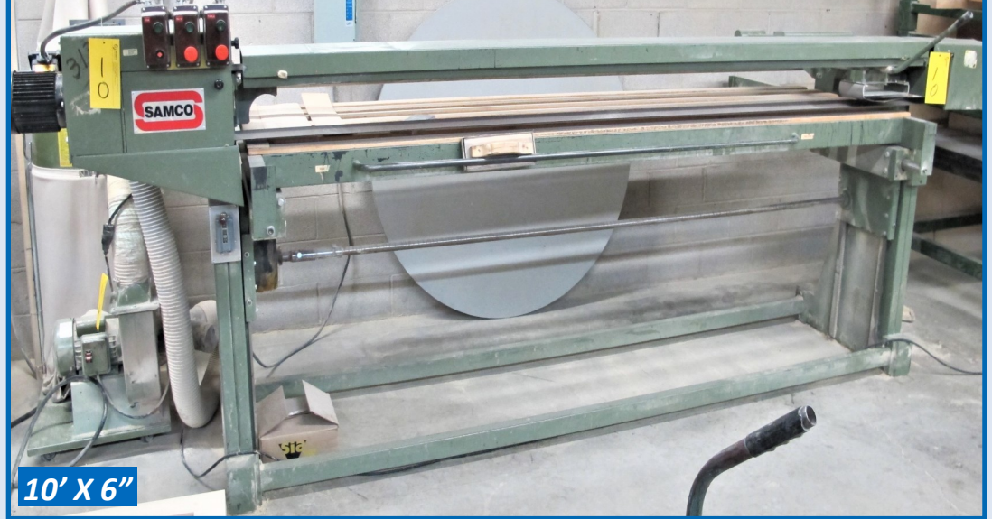
SAMCO STROKE SANDER